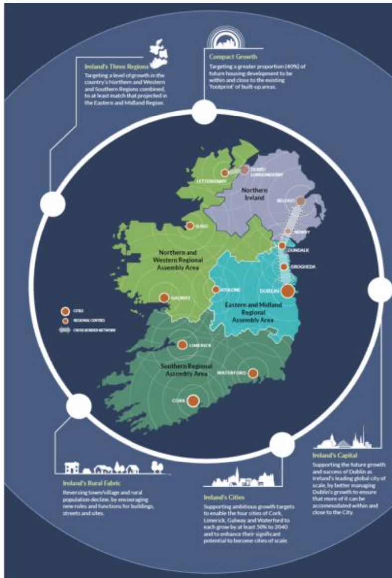
Figure 2: Spatial representation of the NPF's 'three regions'.

2.14 The NPF splits the country into 3 regional areas as set out in Figure 2. It recognizes the role Derry, particularly with its links to Letterkenny, plays in the wider the Northern and Western Regional Assembly area. Each area will develop a Regional Spatial and Economic Strategy, with the emphasis on the following for the Northern and Western RSES - set out a strategic development framework for the Region, leading with the key role of Sligo in the North-West, Athlone in the Midlands and the Letterkenny-Derry cross border network.