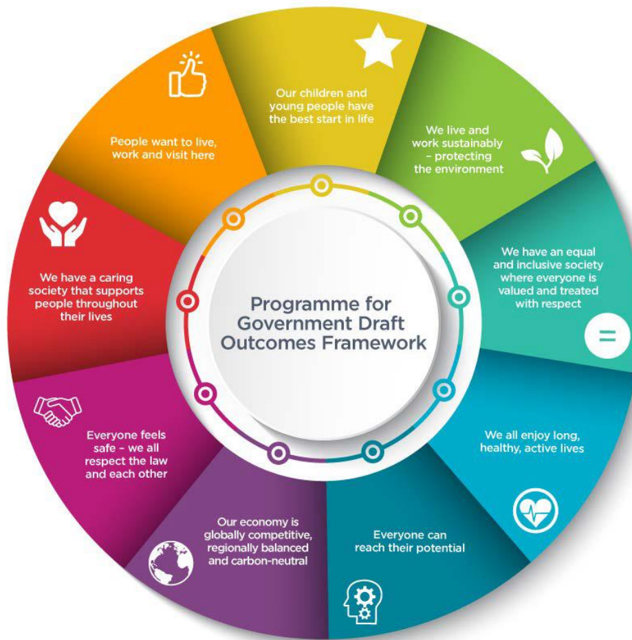
NI Programme for Government Draft Outcomes Framework 2021

2.7 The recent updated draft Programme for Government Outcomes Framework issued for consultation between January and March 2021 has a proposed strategic framework of nine Outcomes. The PfG will be underpinned by a budget and supported by key Executive strategies including an investment strategy, an economic strategy and an anti-poverty strategy aimed at building a strong and prosperous society by tackling disadvantage and achieving sustainable economic growth. PfG draft Outcomes Framework consultation (northernireland.gov.uk)