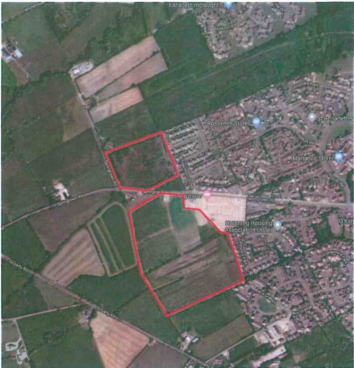
Not to scale (Extract from Google Maps)