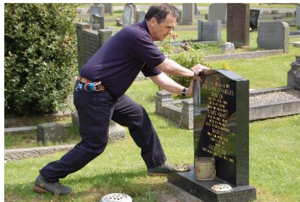
Correct testing stance - larger memorial

8. A memorial will only fail the safety inspection if it will move and continue to move until it would potentially fall to the ground under an initial firm but reasonable force approximating 25 kg (250 Newtons). Memorials that move but do not show potential to fall to the floor following the 'initial' force, will not be considered unsafe.